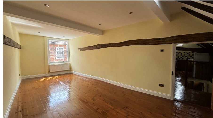
Entrance hall Stairs to first floor. Cupboard housing gas fired boiler