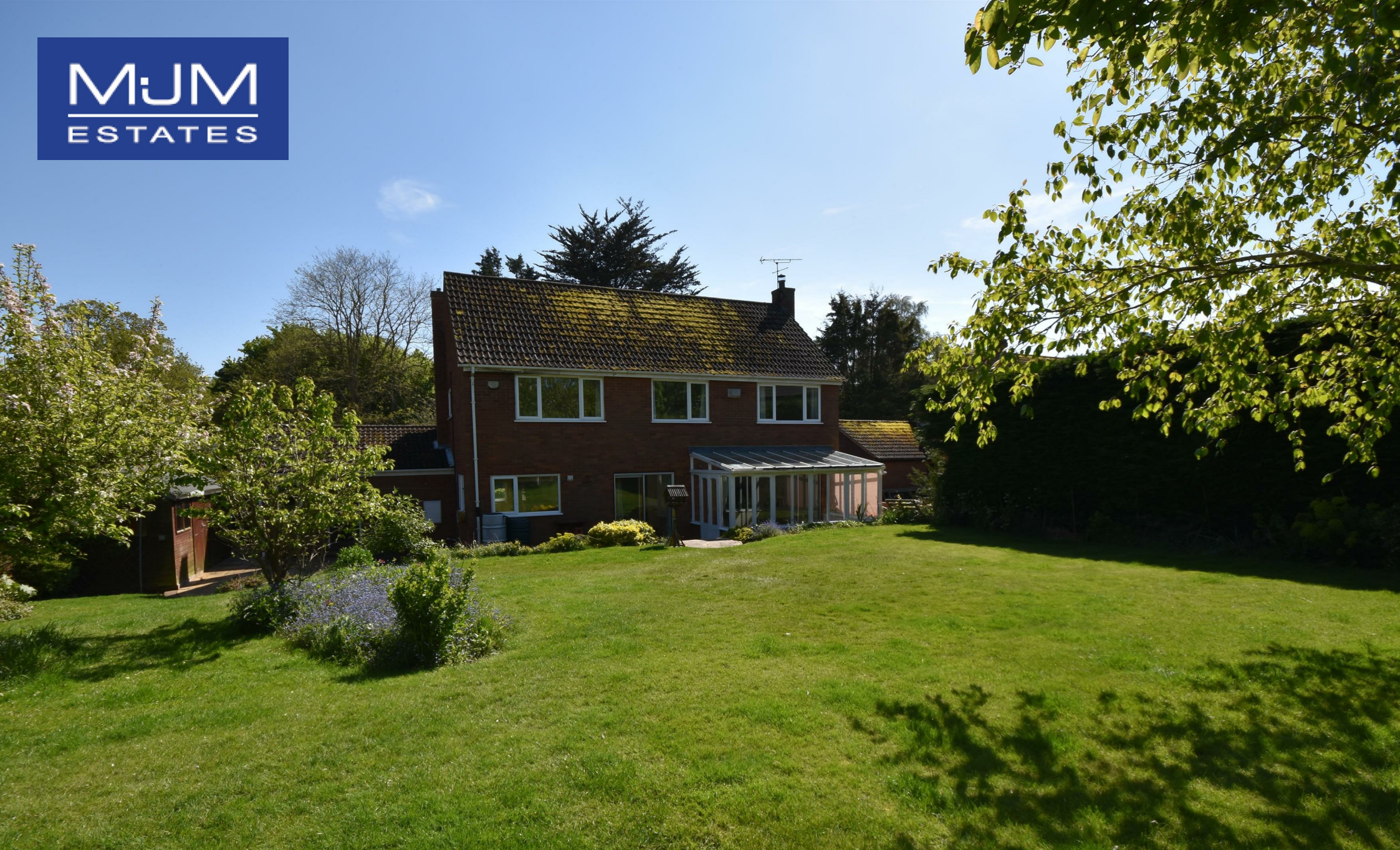
The Gables Lower Street, Ipswich, IP9 2SQ £2,250 PCM Unfurnished